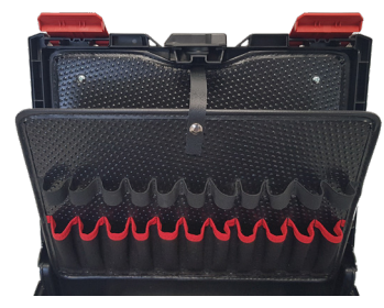
HAND TOOL PANEL