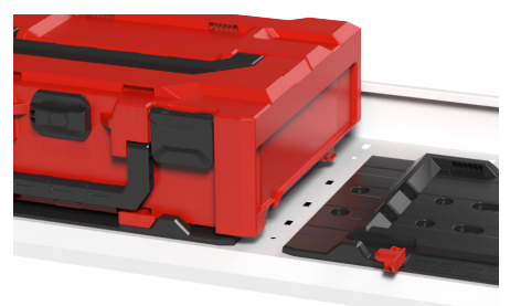
UNIVERSAL ADAPTERPLATE FOR ANY SHELVE