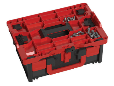
USED AS SMALL PARTS ORGANISER