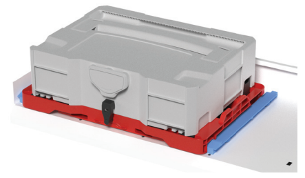
FIT IN THE SORTIMO RACK SYSTEM