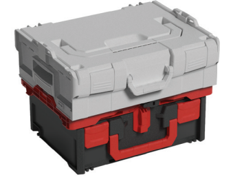
CONNECTION WITH MOST POPULAR CASE SYSTEMS