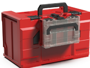
META BOX 63XS CONNECTS AS WELL TO THE META BOX 280L CASE