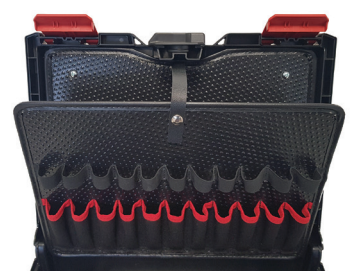
HAND TOOL PANEL