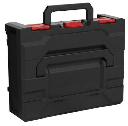
metaBOX 145 M External dimensions: 446 x 345 x 145 mm Inner dimensions: 429 x 317 x 110 mm Weight: 1.95 kg