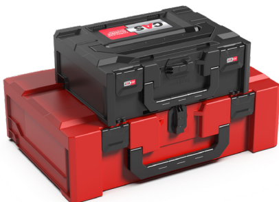
CAS 145S CASE CONNECTED TO 185XL METABOX CASE