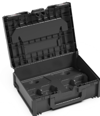
DELIVERY CONDITIONS: M145S [UN] CASE + INSERT (W/O BATTERY, W/O CHARGER)